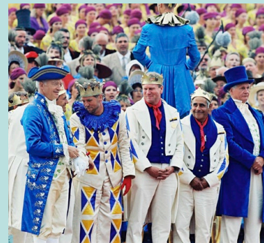
Winegrowers' Festival in Vevey (CH)