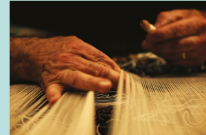
Weaving in Aubusson (FR)