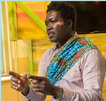
Anansi storytelling (NL)

'The "intangible cultural heritage" means the practices, representations, expressions, knowledge, skills – as well as the instruments, objects, artefacts and cultural spaces associated therewith – that communities, groups and, in some cases, individuals recognize as part of their cultural heritage. This intangible cultural heritage, transmitted from generation to generation, is constantly recreated by communities and groups in response to their environment, their interaction with nature and their history, and provides them with a sense of identity and continuity, thus promoting respect for cultural diversity and human creativity. [...]'