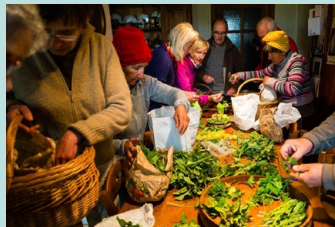
Gathering of wild herbs, fruits and mushrooms in the Massif des Bauges