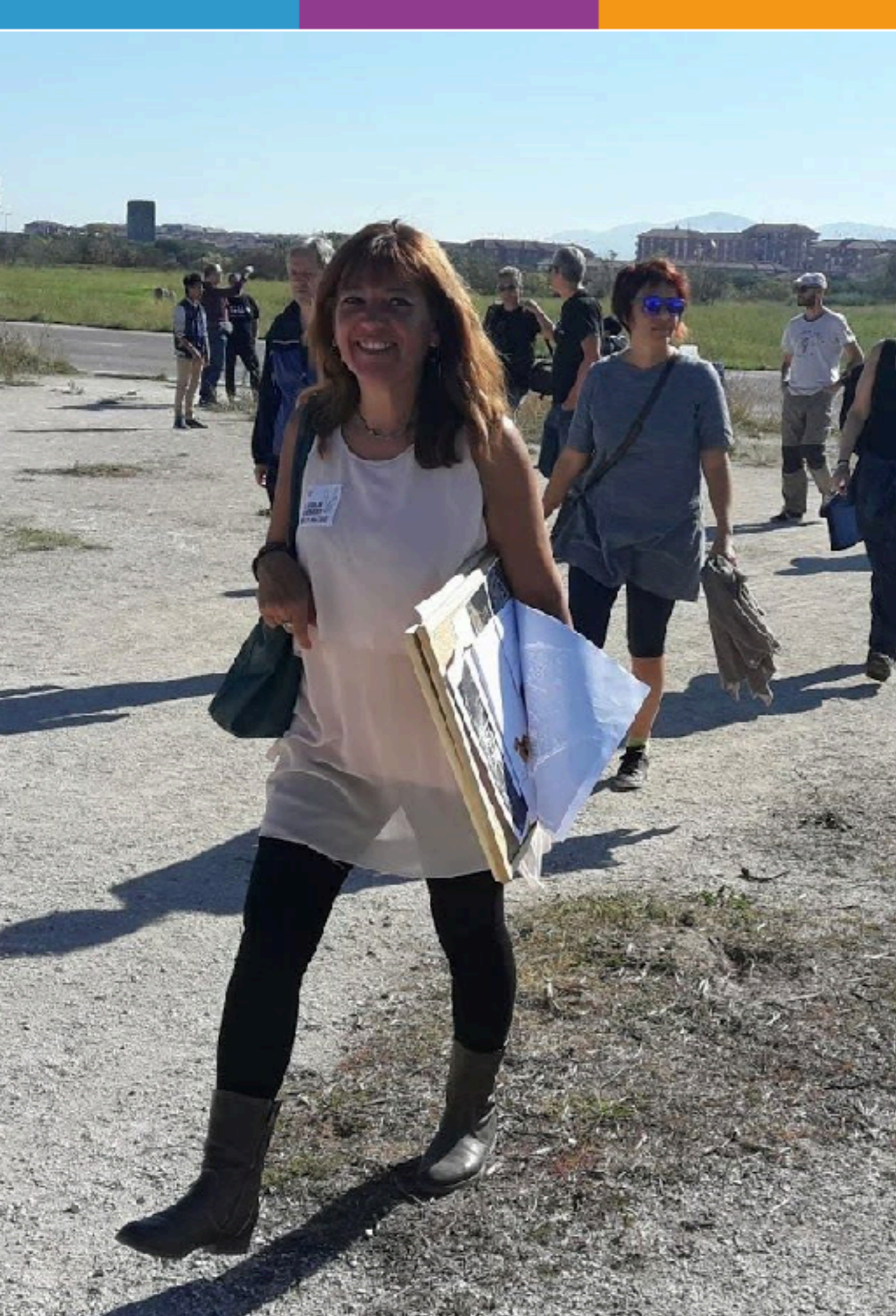
Exhibit & tell

Involve the whole city in the knowledge of the local ICH, through tours, conferences, workshops and meeting with communities